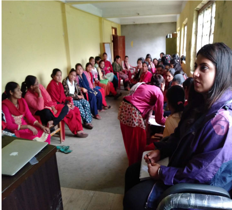
Meeting of Himalayan Innovations leaders at Khanikhola Rural Municipality